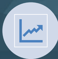
COVID PANDEMIC TRANSITION TO COMMERCIALIZATION