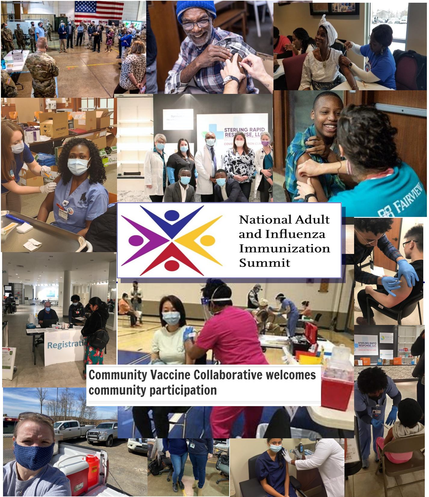
Community Vaccine Collaborative welcomes community participation