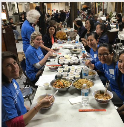
Phat An Temple, 2016