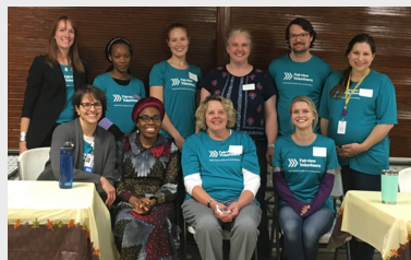
Strong Tower Parish, 2018