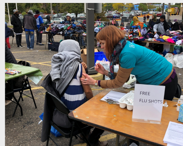
Day of Dignity: Masjid An Nur Health Fair, 2018