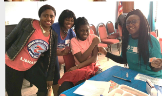
Organization of Liberians in Minnesota, 2018