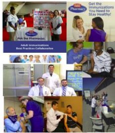
Honorable Mention Winners