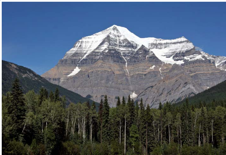
HOW HIGH IS YOUR MOUNTAIN