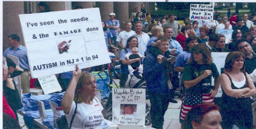
PROTEST Hundreds objected to the mandated flu vaccinations.