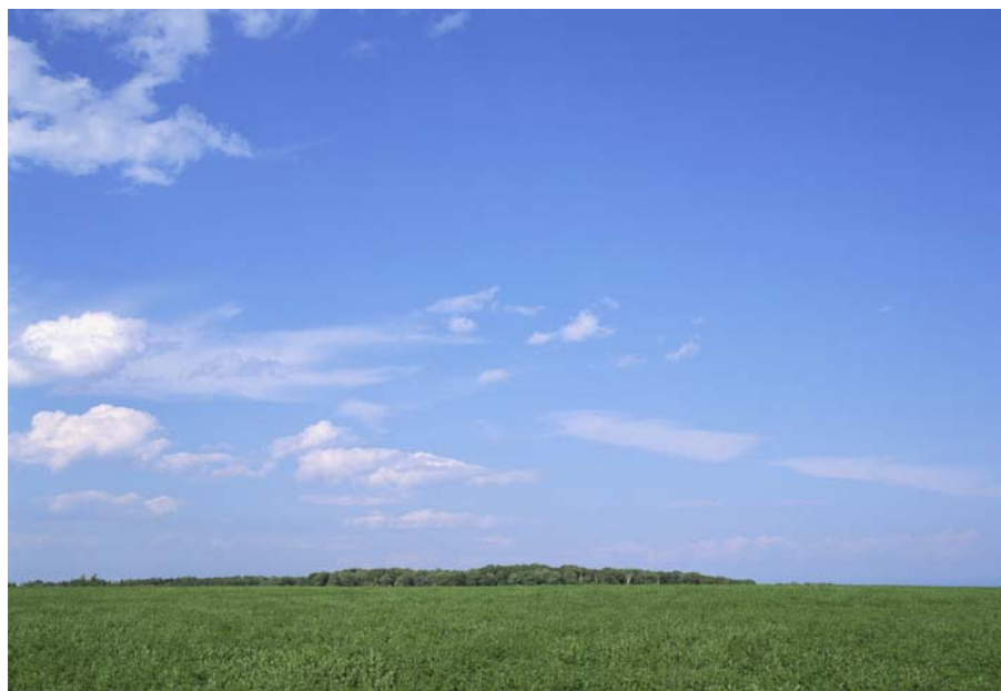
A BRIGHT SUNNY DAY