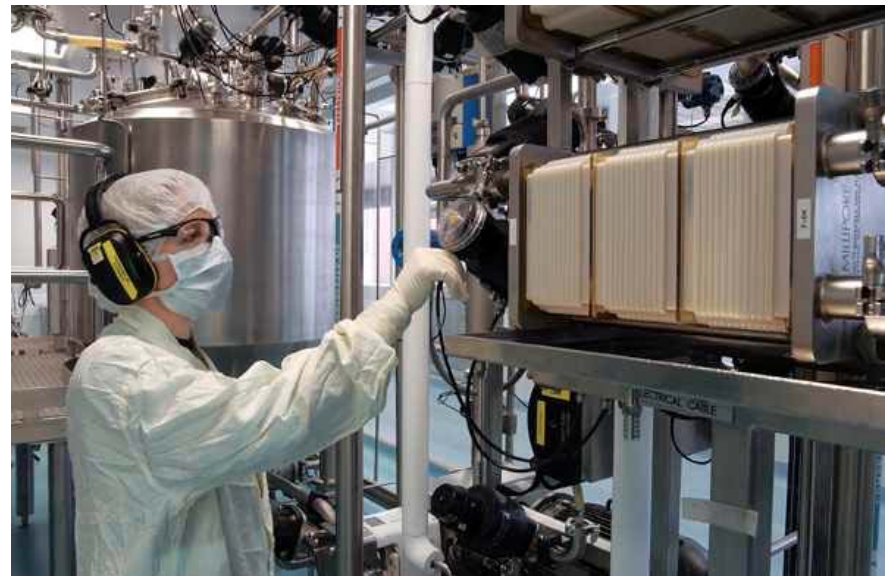
Filtration process at CSL's new flu vaccine center